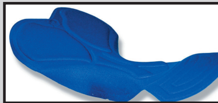
Men's Bib Shorts

We do not offer a "Pro" and "Club" pad. Our philosophy is that EVERY cyclist deserves the best so your team will use the same pad as the pro teams we sponsor.